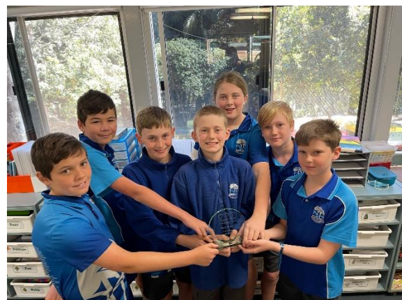
STEM - MASTERMINDS