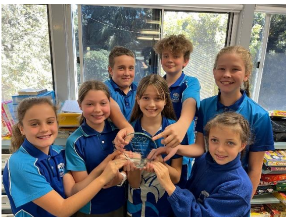
THE ARTS – ART ATTACK